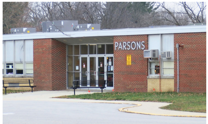
James B. Parsons Elementary School