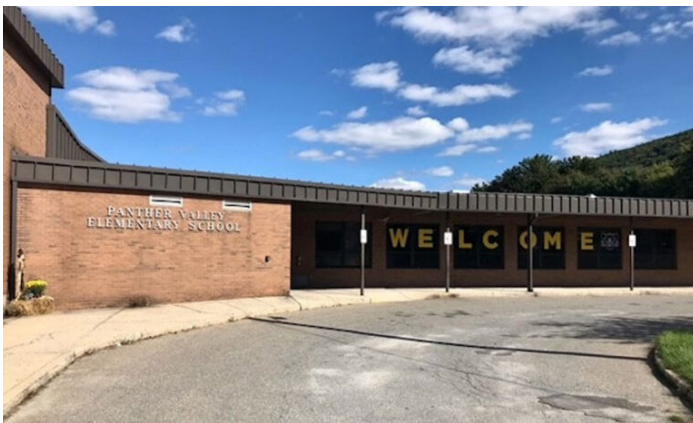
Panther Valley Elementary School